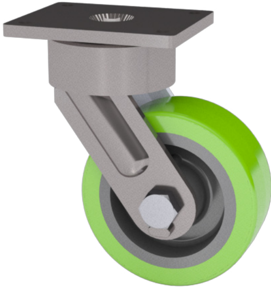
Item Shown: 87-08302-43-1